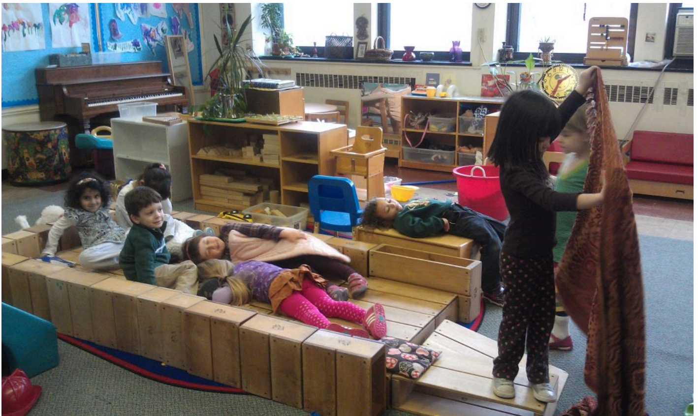
Fun at Preschool