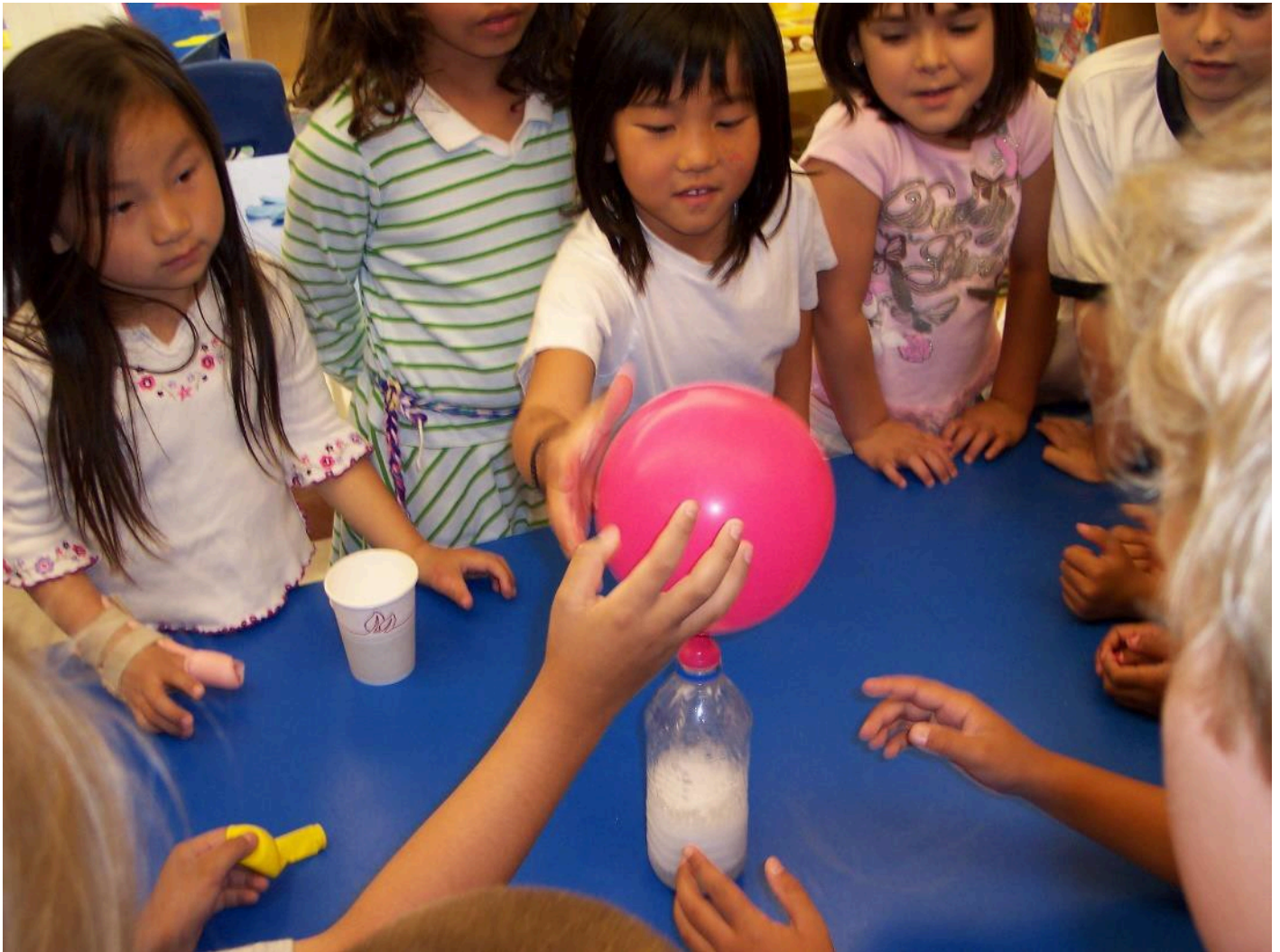
untitled photo licensed under Creative Commons CC BY by Seattle Parks and Recreation, taken November 30, 2003, from Flickr

When a classroom emphasizes play, educators ensure that learning occurs by creating an environment that encourages the development of vital skills. Teachers should also provide times in the day for the children to gather as large- or small-groups to engage in activities planned by the teacher. While the adult will guide students more during group instruction, the activities planned should be playful in nature and should incorporate opportunities for the children to make choices.