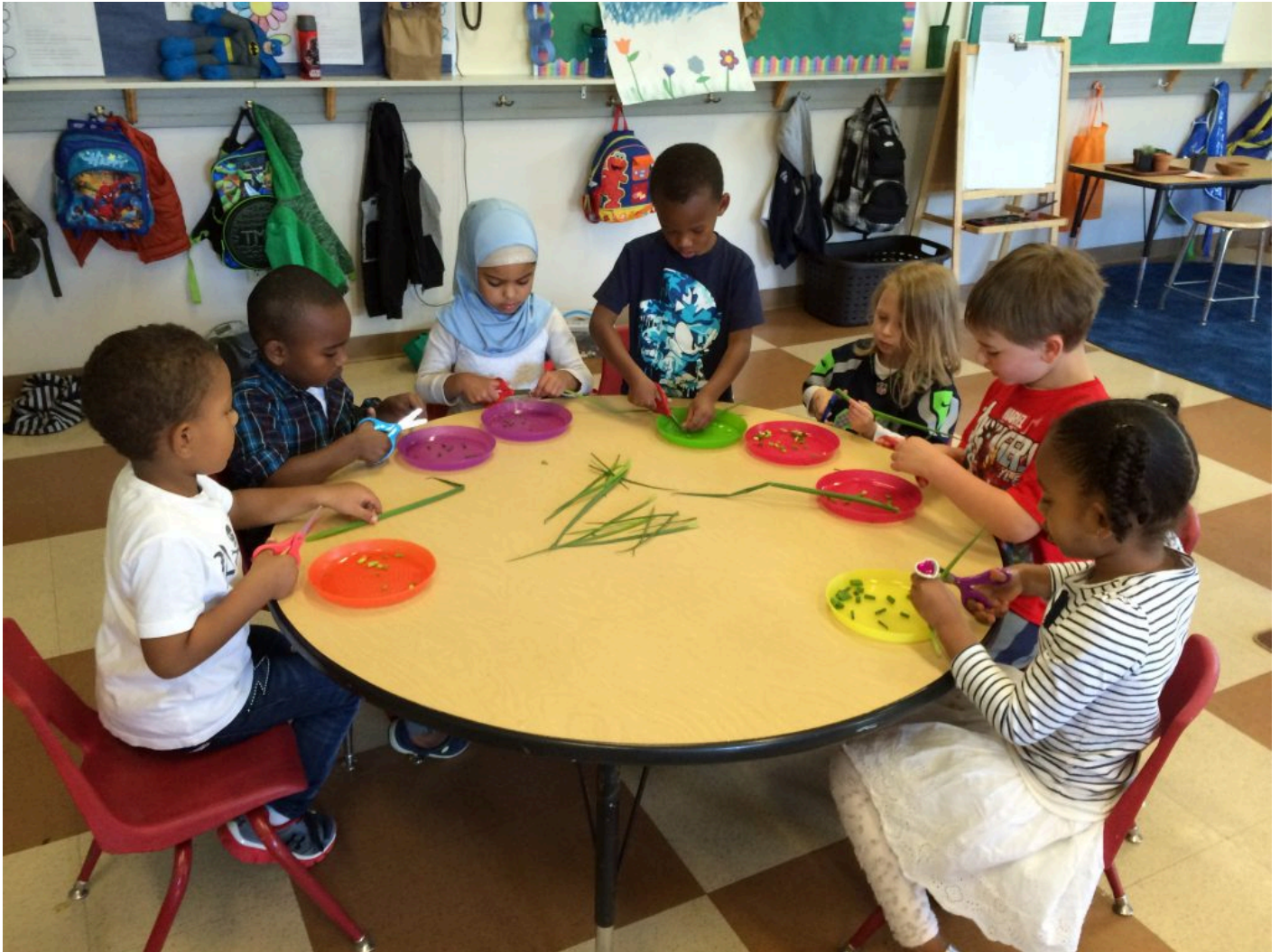
Preschool Cooking Programs