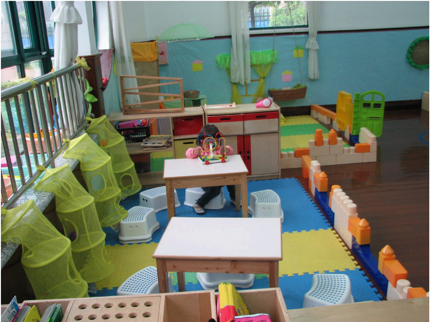
Untitled image of a child playing in a daycare

Preparing the learning environment for exciting and effective learning is the first step in successful teaching. Taking time to select, arrange and introduce a wide variety of age-appropriate materials and equipment will enhance the quality of care. Learning centers should reflect current curricular goals and should be changed, rearranged and updated to current student interests often.