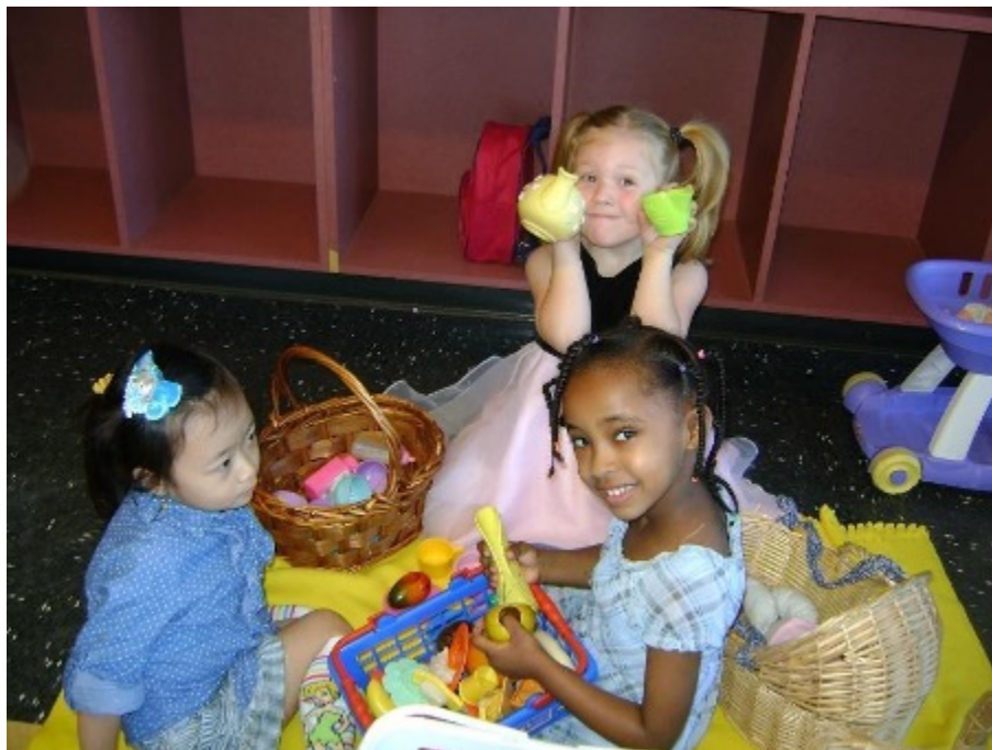
Children playing