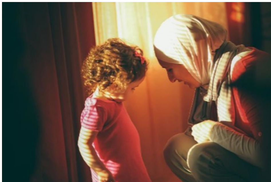
Untitled image of woman and child by Basheer Tome CC BY license via Flickr.