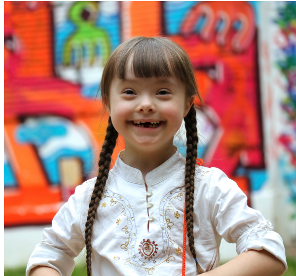
Special Populations

While development generally follows a predetermined progression, effective educators need to recognize that the development of each child is unique. Children vary in their experiences, interests, strengths, learning styles, and knowledge. "Development and learning also occur at varying rates from child to child and at uneven rates across different areas for each child" 1 .