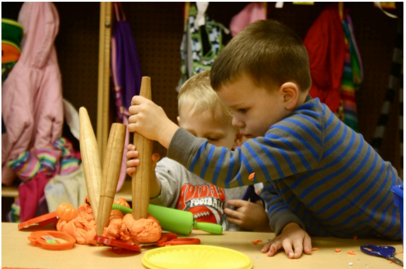
Preschool Joy by Kristin :: Prairie Daze CC BY license via Flickr.

Because of the interrelatedness of the areas of development, it is important for the early childhood educator to teach the whole child. This means that educators need to focus not only on academic (or cognitive) growth but also on physical (motor) skills, language skills, and social- emotional (social & play) skills. By addressing all areas of development, teachers ensure that they teach the whole child.