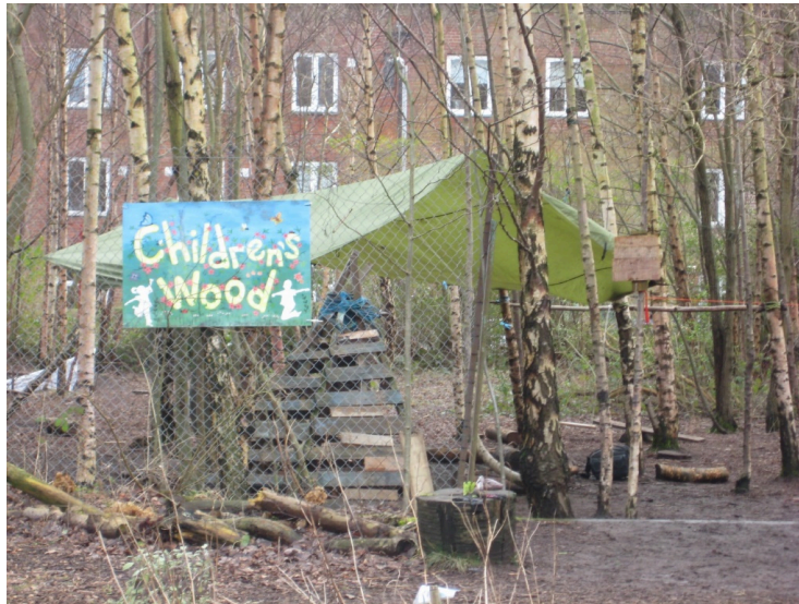
Nature and woodland play sites can be found within urban, city centres