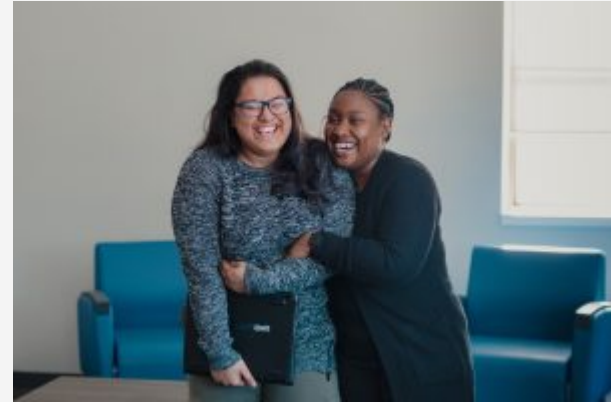
Enjoying A NSCC common area.

Likely to be one of the first people you meet on campus, CAs are NSCC students who are chosen leaders in Campus Housing. Students attending NSCC with previous Campus Housing staffing experience will be considered for leadership opportunities with NSCC Campus Housing and are encouraged to apply.