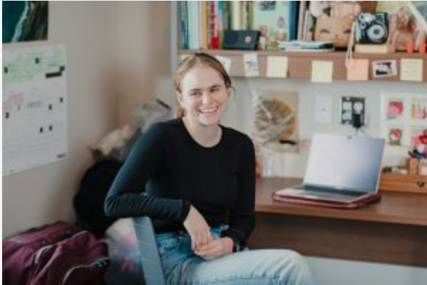
A CA in a NSCC Residence

Likely to be one of the first people you meet on campus, CAs are NSCC students who are chosen leaders in Campus Housing. Students attending NSCC with previous Campus Housing staffing experience will be considered for leadership opportunities with NSCC Campus Housing and are encouraged to apply.